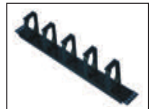
1U cable manager